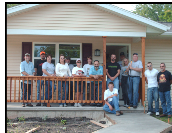
Pictured on the front porch of the Elmhdati Family House after finishing the "final cleaning" is the HOG Chapter of FDL County.