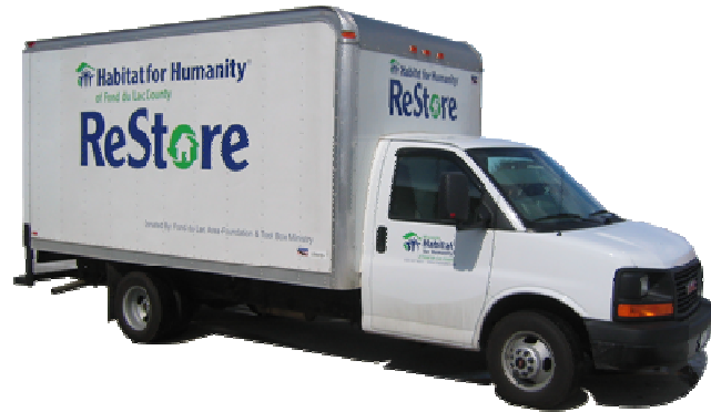
Habitat ReStore Truck donated by: Fond du Lac Area Foundation and Tool Box Ministry

The ReStore has a new phone number : 920-921-2893 during open store hours. If you have not been to the ReStore yet, we invite you to stop in and check us out as we are open to the public. Inventory changes weekly with items such as: new and gently used doors, windows, plumbing, heating, tools, cabinets, furniture, flooring, artwork, home goods, antiques, paint and supplies, caulk and appliances. ReStore hours are Thursday and Friday from 10 a.m. to 5 p.m. and Saturday from 9 a.m. to 3 p.m. Drop off of donations are accepted during store hours or by appointment if called in ahead.