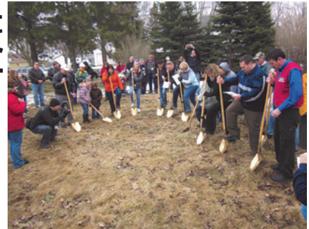
Groundbreaking Ceremony held on April 2, 2011

Make your mark on Fond du Lac and Help Build IT! We are accepting corporate sponsorships on two houses to be built this summer! Make a difference in our community and in the lives of others by sponsoring a build day with your business, family, church group or service organization. Or sponsor a day, and bring co-workers together as they build side-by-side and strengthen your work team!